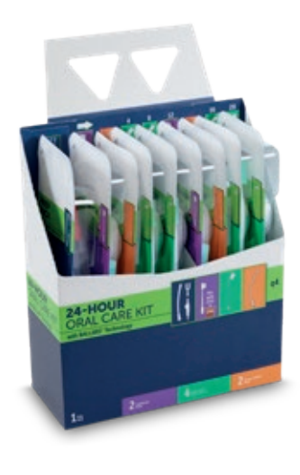
AVANOS* Oral Care Kit - q4