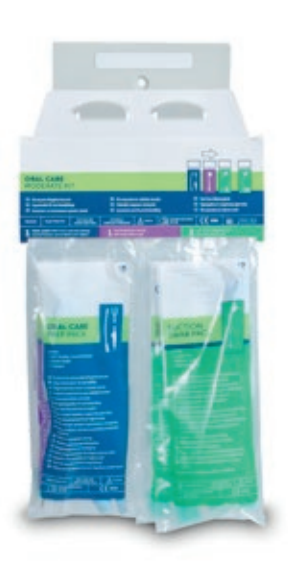
AVANOS* Oral Care Moderate Kit