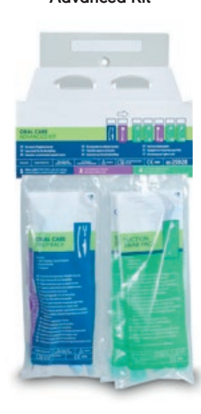
AVANOS* Oral Care Advanced Kit