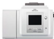
BiPAP A30 and BiPAP A40