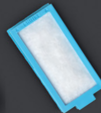
Ultrafine pollen filter