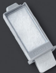
Reusable pollen filter