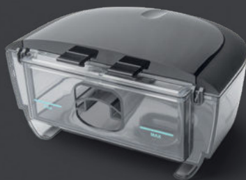
Water tank with lid