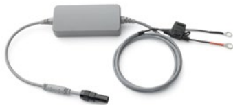
Cable, 12/24V battery with terminals (1127401)