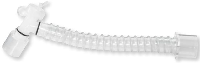
Flexible trach adapter with 22 mm connection (1073902 10/pack) Connects to exhalation ports used with the passive circuit.