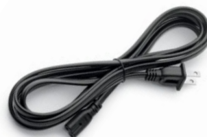
Power cord, straight C7 end - 8ft