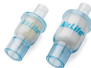
Airlife, pediatric (C06273) Airlife, adult (C06274)