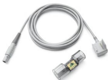
Electronic flow sensor accessory with cable, adult/ped (1132106 )