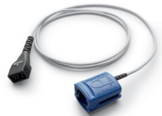
Re-usable adult SpO 2 sensor (Nonin) (936)