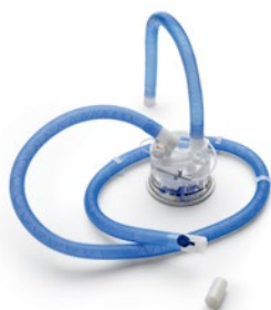
RT202 adult single limb heated circuit kit (1141426)