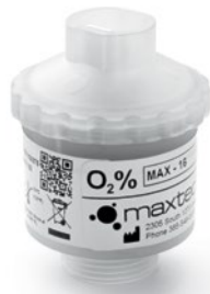
FiO 2 sensor assembly (1134668)