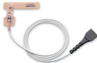
Pulse oximeter sensor, pediatric (1070693)