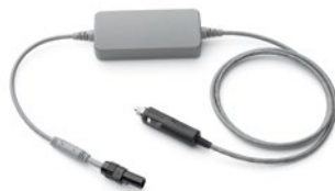
Cable, 12/24V battery with car adaptor (1127402)