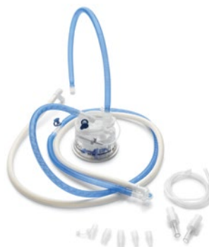
RT265 Fisher & Paykel infant dual limb (1141548)