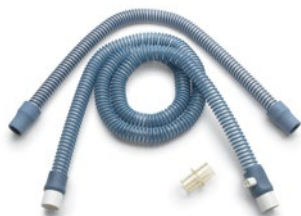
Fisher & Paykel 900MR810 reusable circuit (1141549)