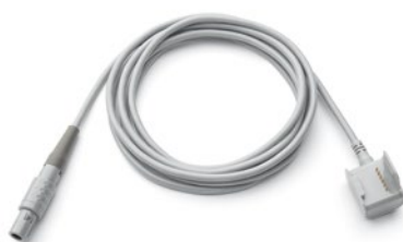
Electronic flow sensor cable (1134592)