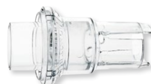
Whisper swivel II (332113)