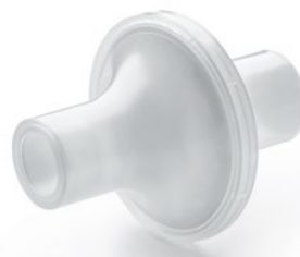
Bacterial/viral filter (1135776 10/pack)