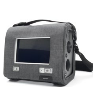
Trilogy Evo in-use case (1133930)