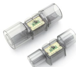
Electronic flow sensor, adult and infant (1134711) (1134712)