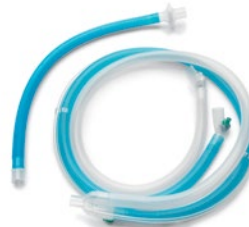
(15mm 1127304)* (22mm 1127303)*