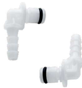
Oxygen inlet adapter (1040390)