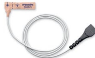
Pulse oximeter sensor, infant (1070694)