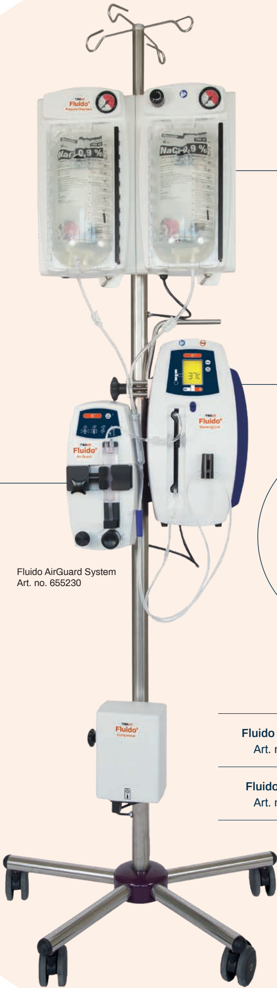
Fluido AirGuard System Art. no. 655230

One unit of refrigerated blood or one-liter crystalloid at room temperature can reduce mean body temperature by 0.25 °C. Fluid warming is the only method that produces direct core warming and is recommended for all intraoperative infusions ≥ 500 mL in adults. 4