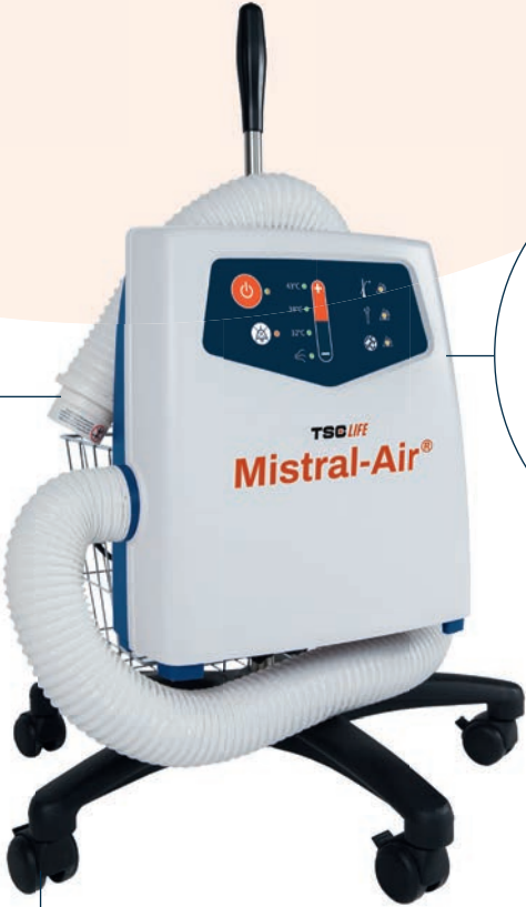
Mistral-Air Warming Unit Art. no. MA1200-EU

With integrated advanced air filtration, you can safely warm your patients with the confidence that 99.95% of particles have been filtered out before reaching the patient. 5